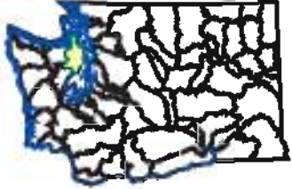
Location of WRIA 17

Map Projection: Lambert Conformal Conic (NAD 83) Datum: North American Datum 1983 Data Source: USGS Hydrology Distribution Data 12-2000 Cartography by: Rachel McPherson, NWIFC November 2002